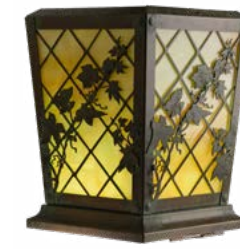
Lattice with Ivy