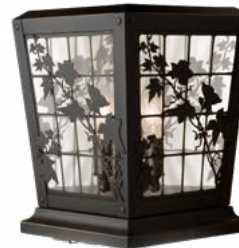
Trellis with Ivy