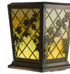
Lattice with Ivy