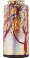
Cherry Blossom Cylinder