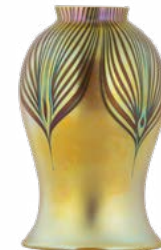
Peacock Feather Tulip

A much wider selection of shades is available on our website.