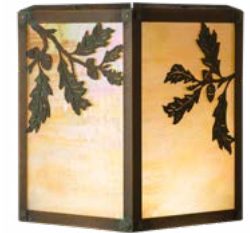
Oak & Acorn