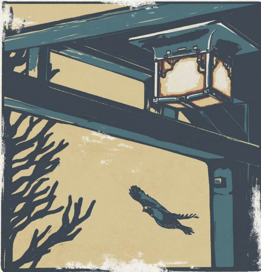
BLACKER HOUSE CEILING LIGHT

'Where historie & architecture come to lyt'