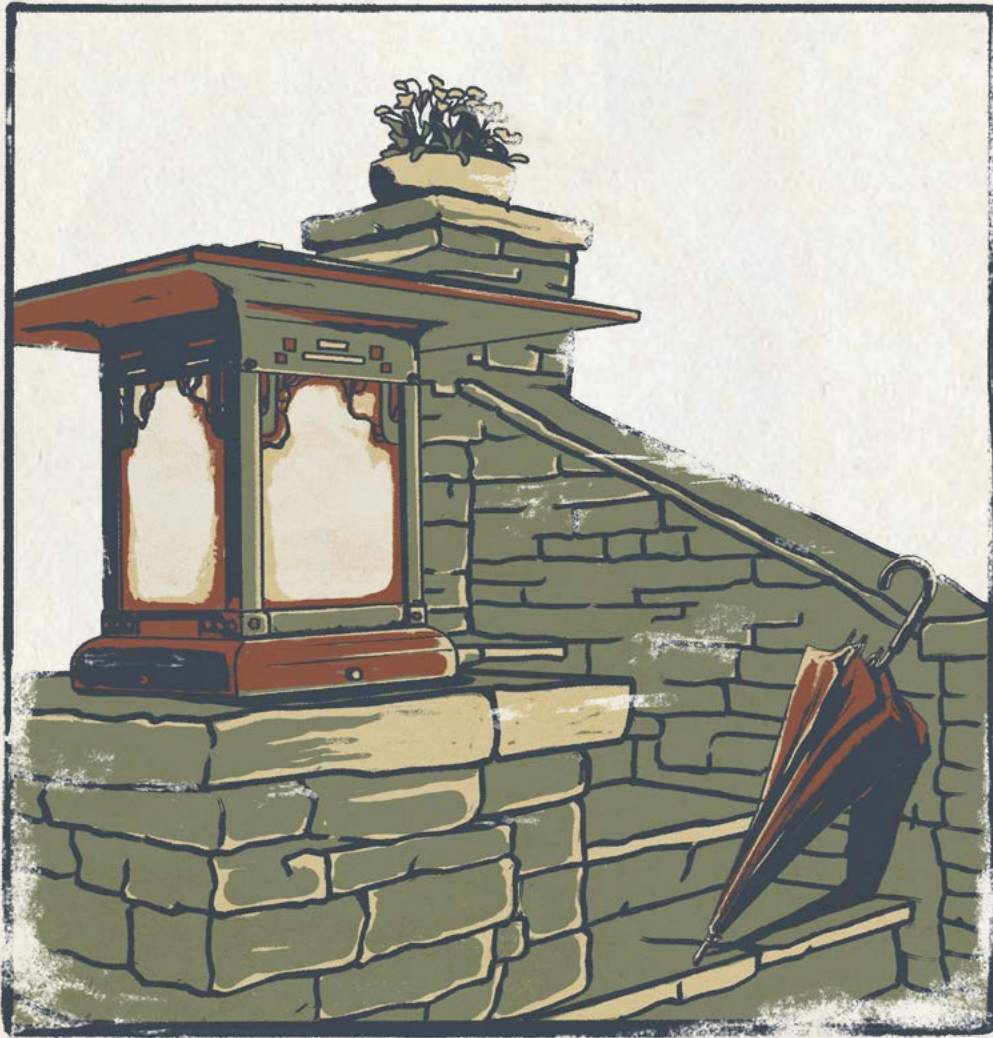
BLACKER HOUSE COLUMN MOUNTED LANTERN

'Where historie & architecture come to lyt'