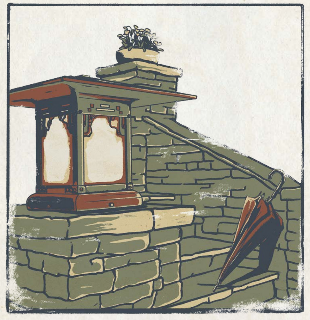
BLACKER HOUSE COLUMN MOUNTED LANTERN

'Where historie & architecture come to lyt'