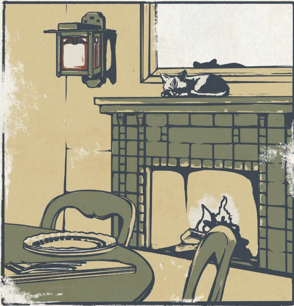
MEDIUM BLACKER HOUSE LIBRARY LANTERN

'Where historie & architecture come to lyt'